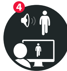
Operator assesses live situation and can issue audio challenges