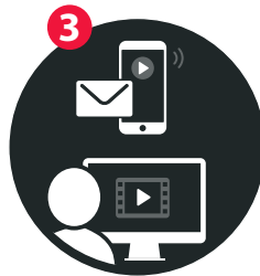
Images relayed to operator and customer