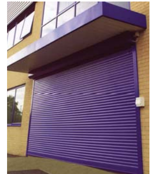
Motorised roller shutter