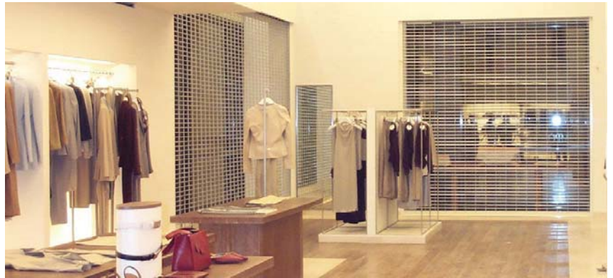
Portcullis roller grille

Our collapsible grilles and portcullis grilles are ideal to protect goods and premises. They combine the strength of steel with an “open” look and feel.