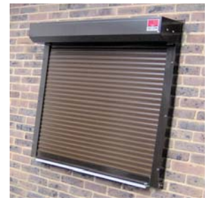
Continental roller shutter